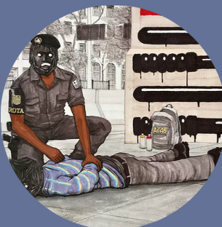
Qhno To laugh