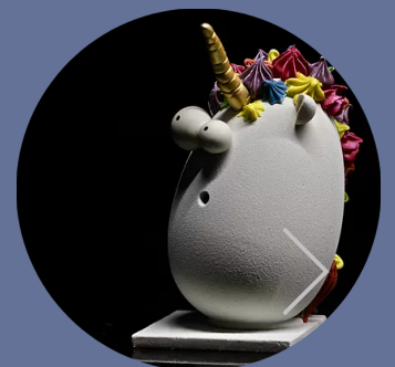
Mao Montiel Heretics Food