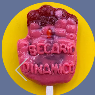
El Chico Paletas Bittersweet